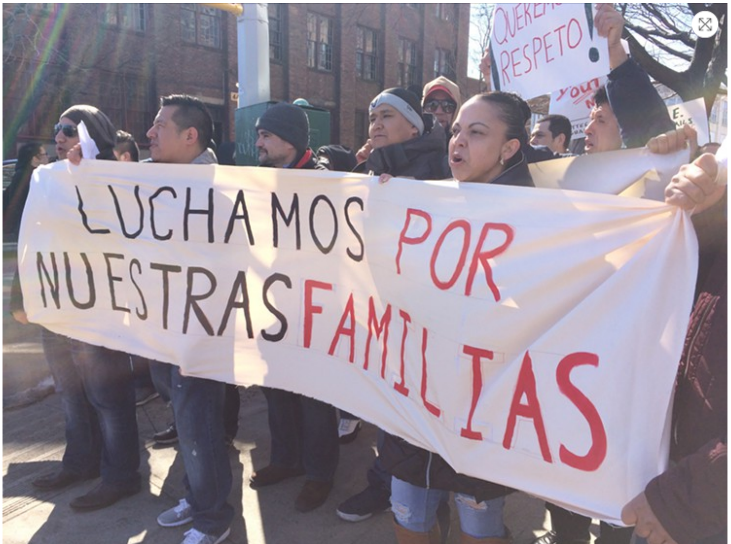
Tom Cat Bakery employees marched through Queens to the bakery yesterday after the company demanded proof they were legal residents.